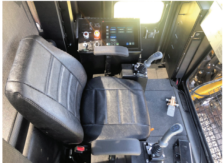
Operator Station with ergonomic seat & joystick controls.